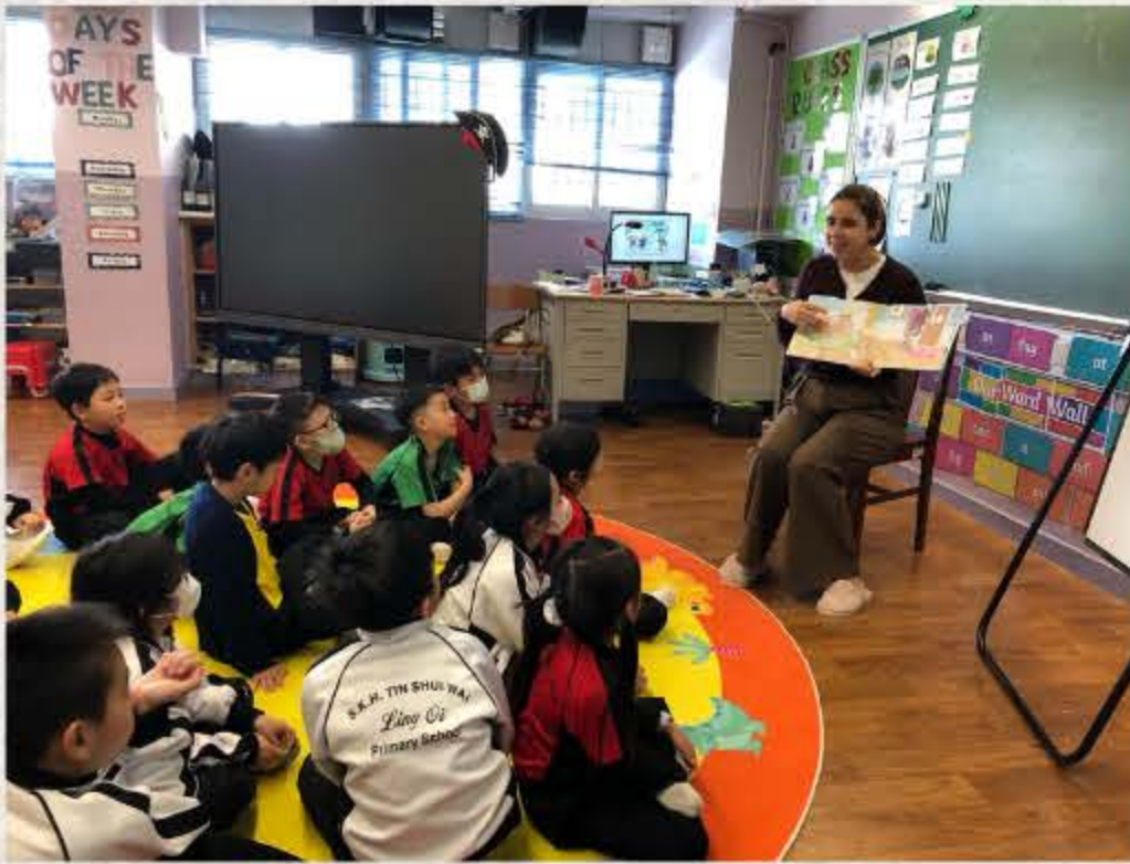
Reading First Snow to wrap up the unit