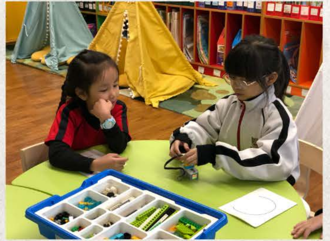
Building our Lego Fans