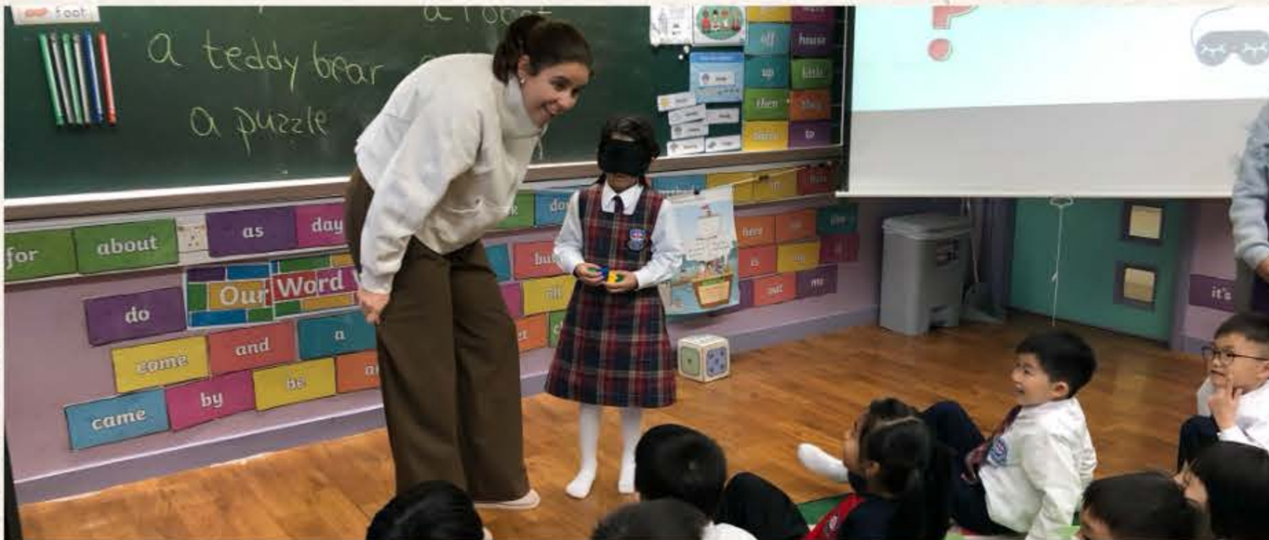
A fun game of Guess the Toy!

Our P.1s have also been working diligently on their RWI Ditty books to practice their reading and writing skills. Keep it up everyone!