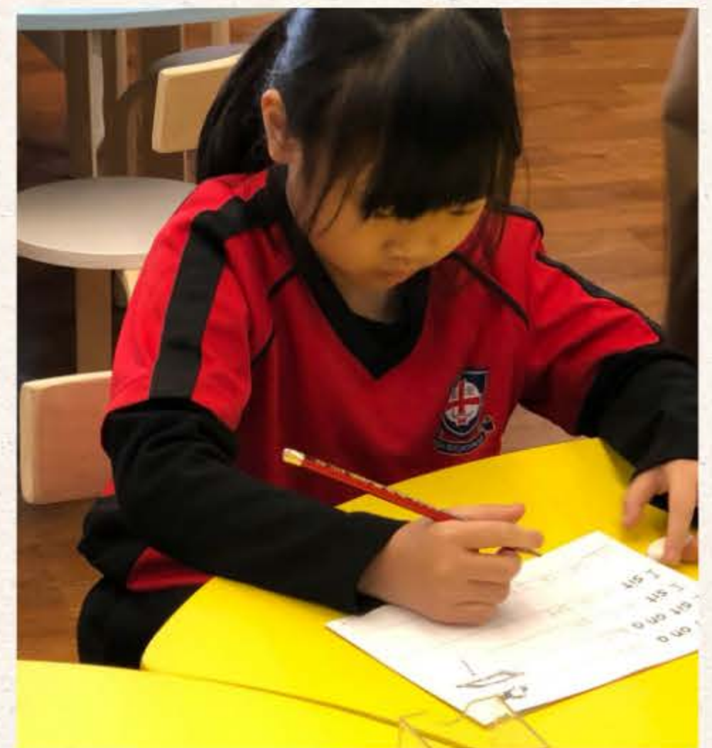
Hard at work with the Ditty