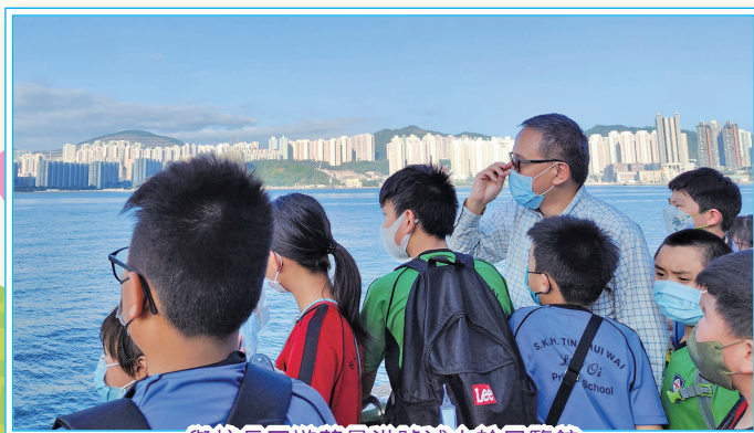
與校長同遊葛量洪號滅火輪展覽館