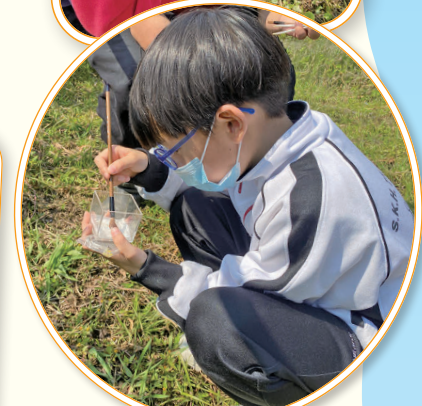
同學們小心翼翼把螢火蟲放到草叢去，不忘叮囑螢火蟲面對新環境要小心和加油。 The students carefully placed the fireflies in the grass and reminded them to be careful and do their best in the new environment.