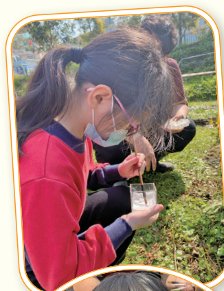
在大埔滘考察，同學們發現許多市區找不到的動植物，這次考察也是書本不能給予的經驗。 During the field trip to Tai Po Kau, the students discovered many plants and animals not commonly found in urban areas. This field trip provided an experience that could not be obtained from textbooks.