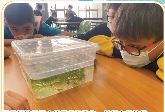
同學認識不同水棲昆蟲和動物，並親自餵牠們。 The students got to know different aquatic insects and animals and personally fed them.

During these months, students needed to regularly clean the habitat of the firefly larvae and provide them with food, pay attention to their feeding and growth changes, and become responsible caregivers for the insects. The larvae also became their "life mentors", making the students more resilient, loving, and attentive children.